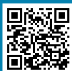
Programme Website 课程网站

Hang Shin Link, Siu Lek Yuen, Shatin, NT, Hong Kong 香港新界沙田小沥源行善里