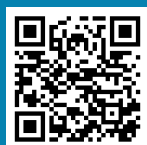
Programme Website 課程網站

Hang Shin Link, Siu Lek Yuen, Shatin, NT, Hong Kong 香港新界沙田小瀝源行善里